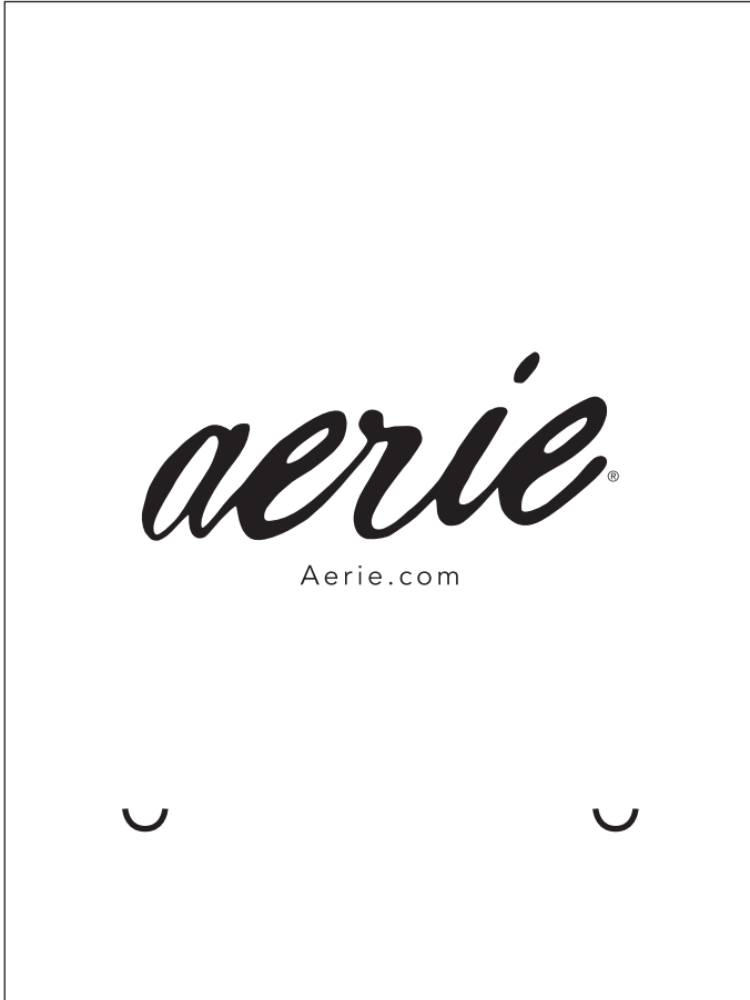
(FRONT OF BAG)