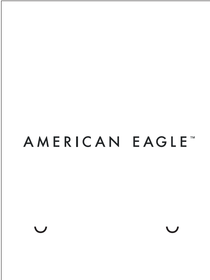
(FRONT OF BAG)