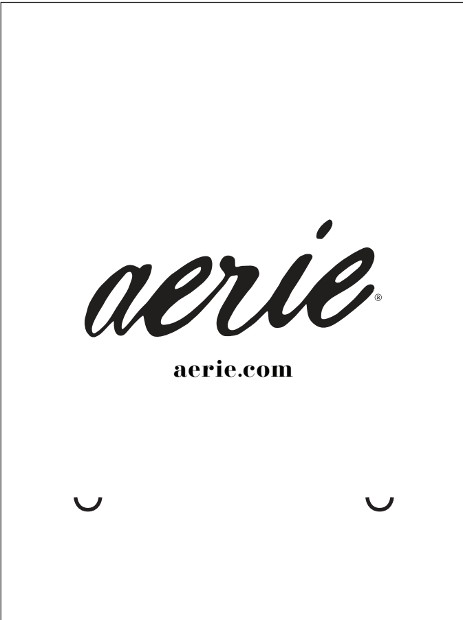
(FRONT OF BAG)